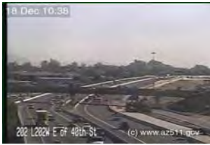
Loop 202 & 40th Street