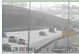
I-10 Mini-Stack South